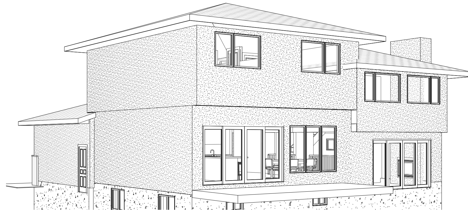
3D CONCEPT VIEW SCALE: NTS