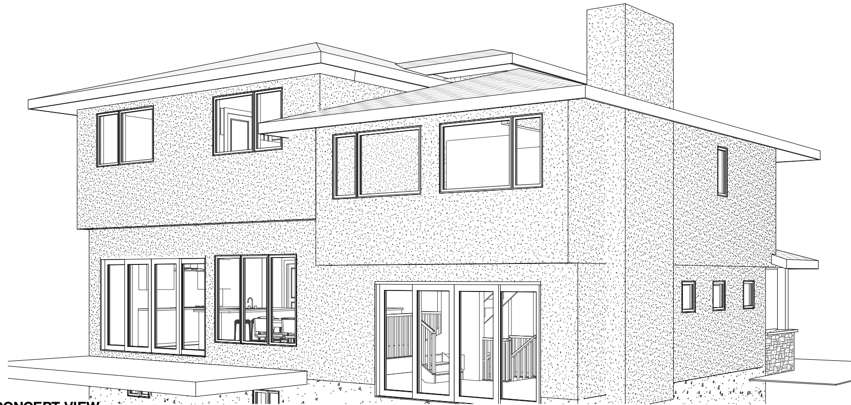
3D CONCEPT VIEW SCALE: NTS