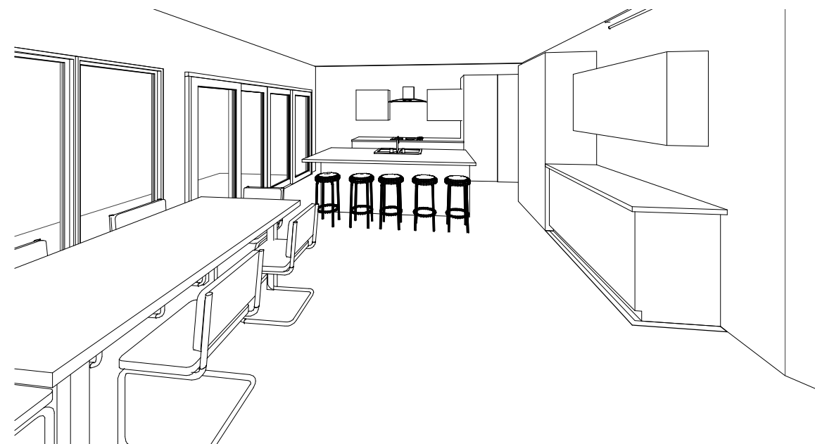
3D CONCEPT VIEW SCALE: NTS