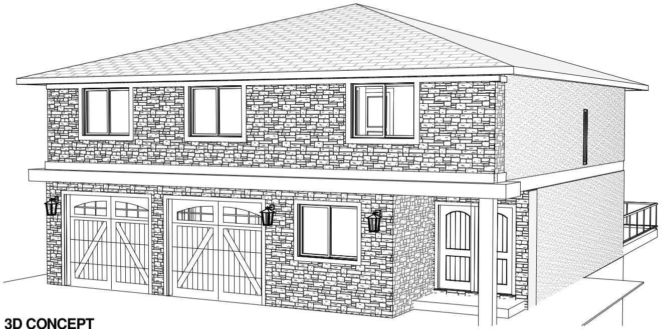
3D CONCEPT SCALE: 3/16" = 1'-0"