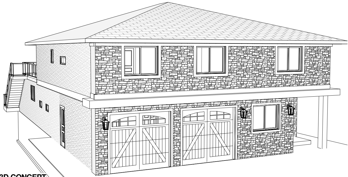
3D CONCEPT SCALE: 3/16" = 1'-0"