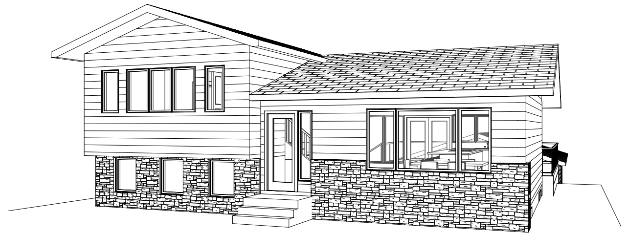
3D PERSPECTIVE 2 - CONCEPT ONLY SCALE:NTS