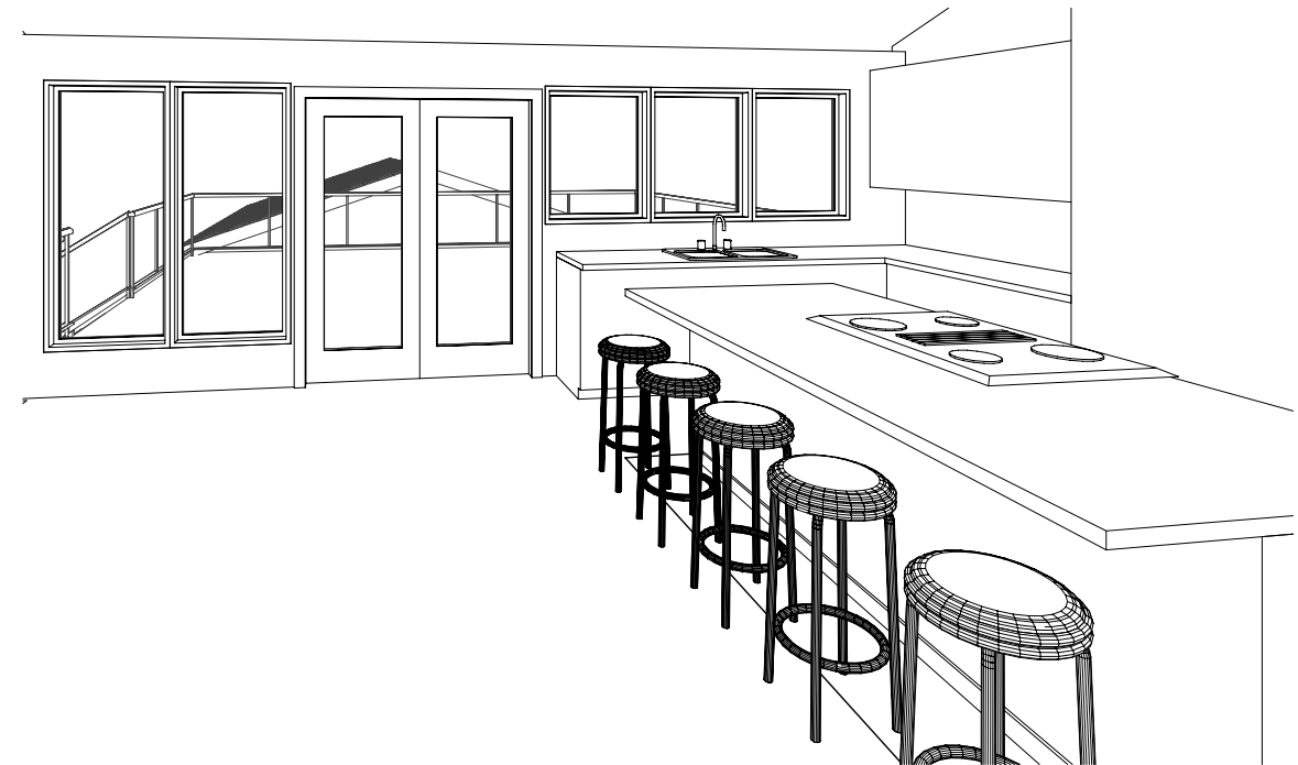
3D PERSPECTIVE 4 - CONCEPT ONLY SCALE:NTS